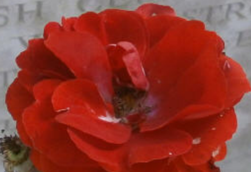
Words and images for Remembrance based on a visit to the Battlefields of WW1 in Belgium and Northern France with students from Silcoates School, Wakefield.

TO THE MEMORY OF THESE THREE BRITISH SOLDIERS KILLED IN ACTION 1916 AND BURIED AT THE TIME IN THE BRITISH CEMETERY WHICH WAS DESTROYED IN LATE 1918 THEIR GRAVES